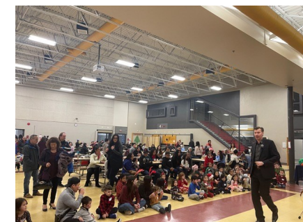
Magician showing off his tricks.