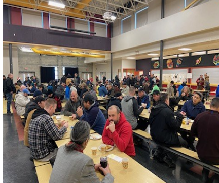
Big crowd attended despite the bad weather.